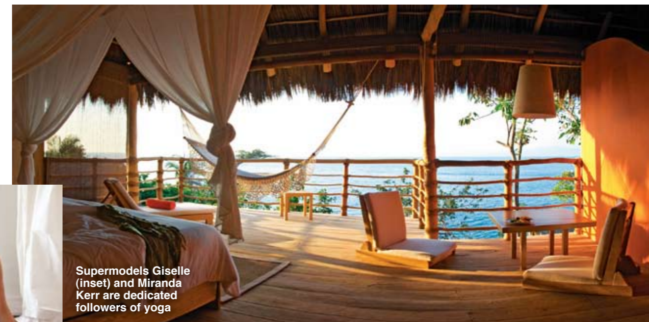
Supermodels Gisele (inset) and Miranda Kerr are dedicated followers of yoga

For more details visit: www.xinalaniretreat.com Places are limited and booking is essential. For more information about Tamal's upcoming retreats also planned for 2011 in Tuscany and Hawaii, visit www.tamalyoga.com